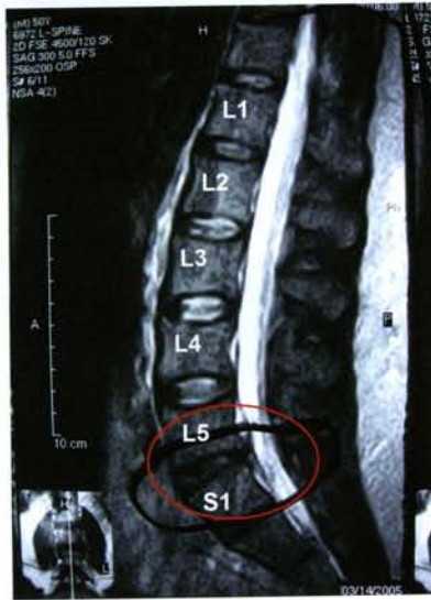
Figure 1b: Post-treatment MRI (03/14/05)