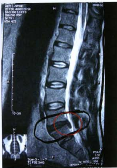
Figure 1a: Pre-treatment MRI (02/02/05)